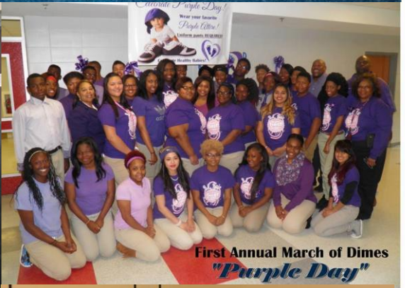
First Annual March of Dimes "Purple Day"